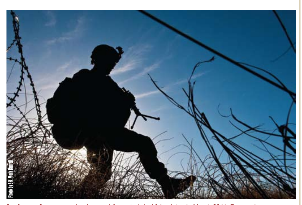
In harm's way —An Army soldier patrols in Afghanistan in March 2011. Researchers are exploring how to distinguish between overlapping symptoms of PTSD and traumatic brain injury.

Once reliable biomarkers emerge for each condition, clinicians will have more evidence on which to base their diagnoses and therapy recommendations.