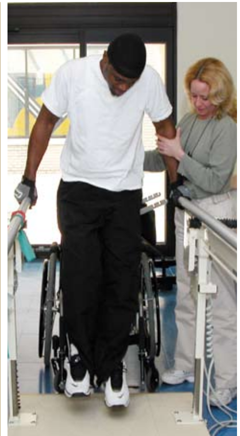
Polytrauma care at the Tampa VA.