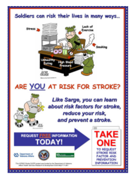
This poster, displayed at selected VA medical centers, was part of an outreach study by VA's Stroke QUERI.