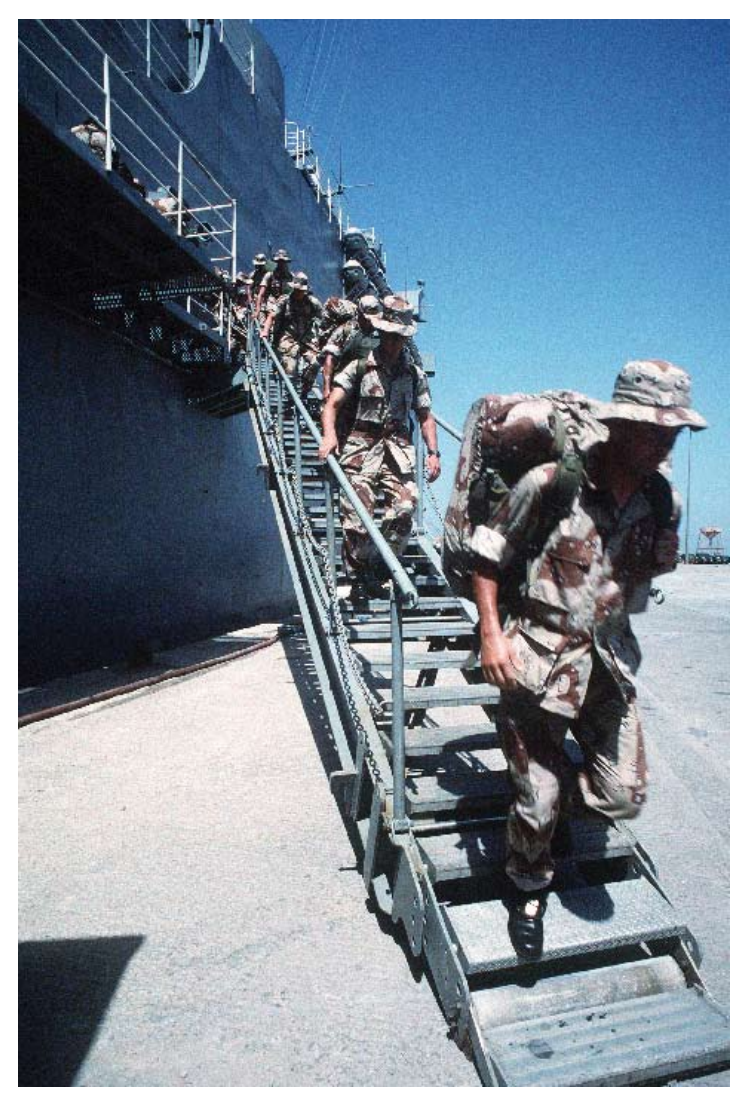
Soldiers deployed in the Gulf War had more new-onset mental-health problems during the war than non-deployed troops, says a new VA study. The gap in mental health had grown smaller but still persisted 10 years later.