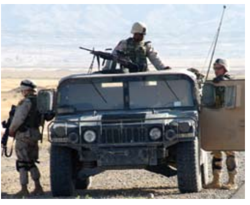
Coping with the effects of blasts —The pressure wave from roadside bombs and other improvised explosive devices (IEDs) can cause traumatic brain injuries for troops even when they are many feet from the source of the blast and suffer no other physical injuries. The Defense and Veterans Brain Injury Center estimates that from 10 to 20 percent of troops serving in Iraq or Afghanistan have suffered some type of brain injury.